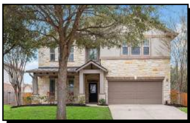
The new home.

The house is located in a quiet neighborhood and has a large upstairs sitting room and four bedrooms. It only added about ten minutes to their work commute, but they