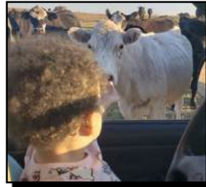
Meeting Snowball the cow.