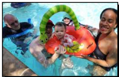
She likes the water and had a great time July 4 at Aunt Carol and Uncle Alec's pool.

care is lunch, where she cleans up extra food that the other kids refuse to eat.