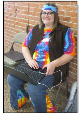
Did 1960's hippies use laptops!

She prepares grants, coordinates board meetings and communication for Rolling Plains.