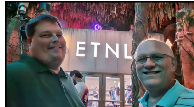
ETNL is the fictional radio station at Meow Wolf Houston.