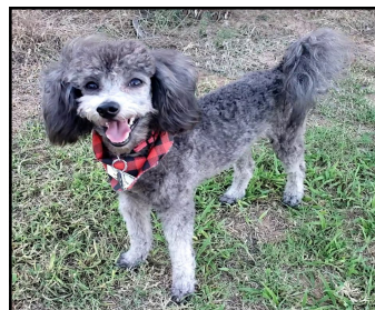
Paladin says "Merry Christmas"

He's named for the Have Gun Will Travel character on the 1960's TV show, not a Dungeons and Dragons class, although his initiative roll is pretty high.