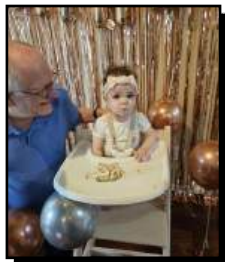
The birthday girl.

She started to walk this summer and has a growing vocabulary.